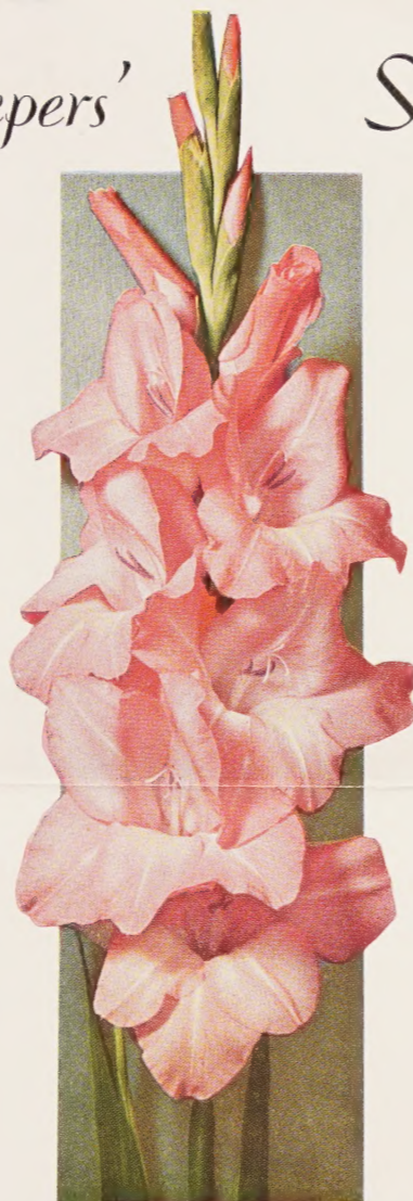
PICARDY $1.35 for 10 $11.00 per 100